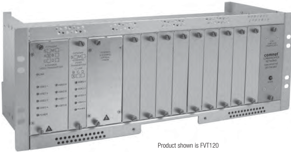
Product shown is FVT120