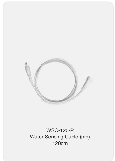
WSC-120-P Water Sensing Cable (pin) 120cm