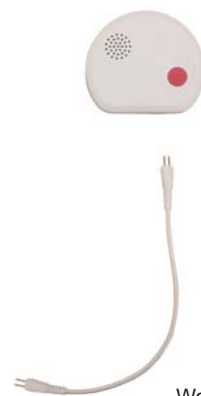
WPC-20 Water Probe Cable 20cm