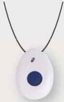
Bluetooth Smart Pendant for Mobile Tracking