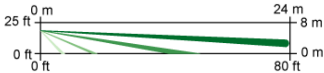
Side View Standard Broad Coverage: 24 m x 16 m (80 ft x 50 ft)