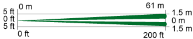
Top View Standard Long Range: 61 m x 3 m (200 ft x 10 ft)