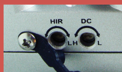
DC Level & HIR Adjustments