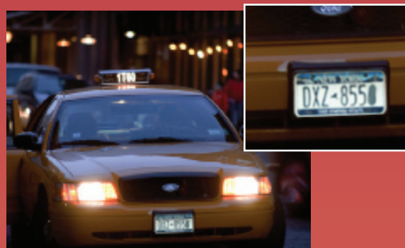
License Plate Camera with Anti-Head Light Technology