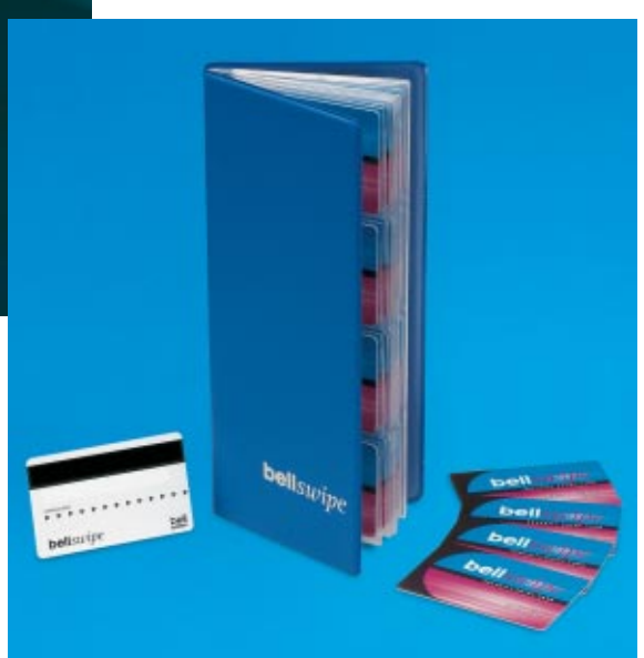
Starter Card Pack