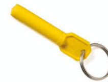
Model BC-K10 Model BC-K50