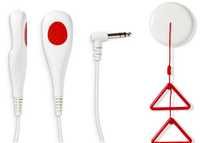
Model BC-PD2 Model BC-PD3