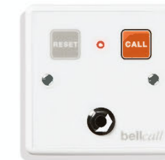
Model BC-CPJ Model BC-EPJ