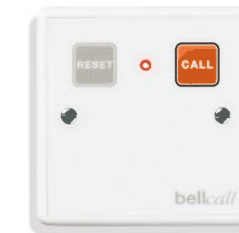
Model BC-CP Model BC-EP

Magnetic Reset Keys BC-K10 and BC-K50 All Call Points can be reset using either the push button or a Magnetic Keys. These bright yellow keys are used to prevent the patient from cancelling their call. The keys are supplied in packs of 10 or packs of 50.