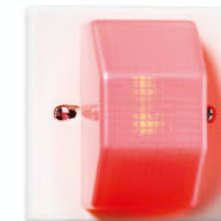
Model BC-OD (illuminated)