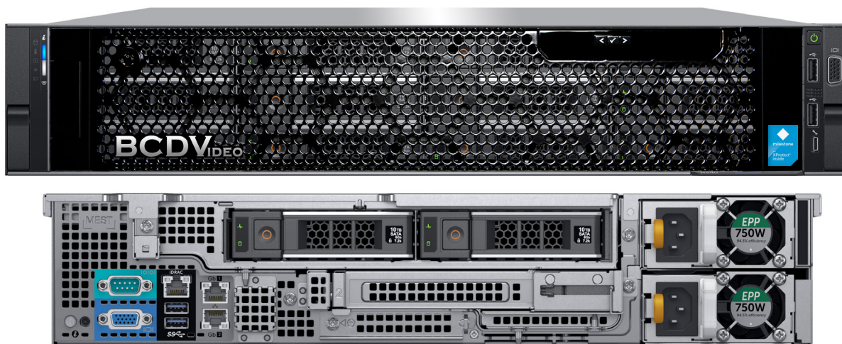
Back - Single Processor Models

5-Year, On-site, NBD, Keep Your Hard Drive Warranty