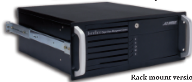
Rack mount version