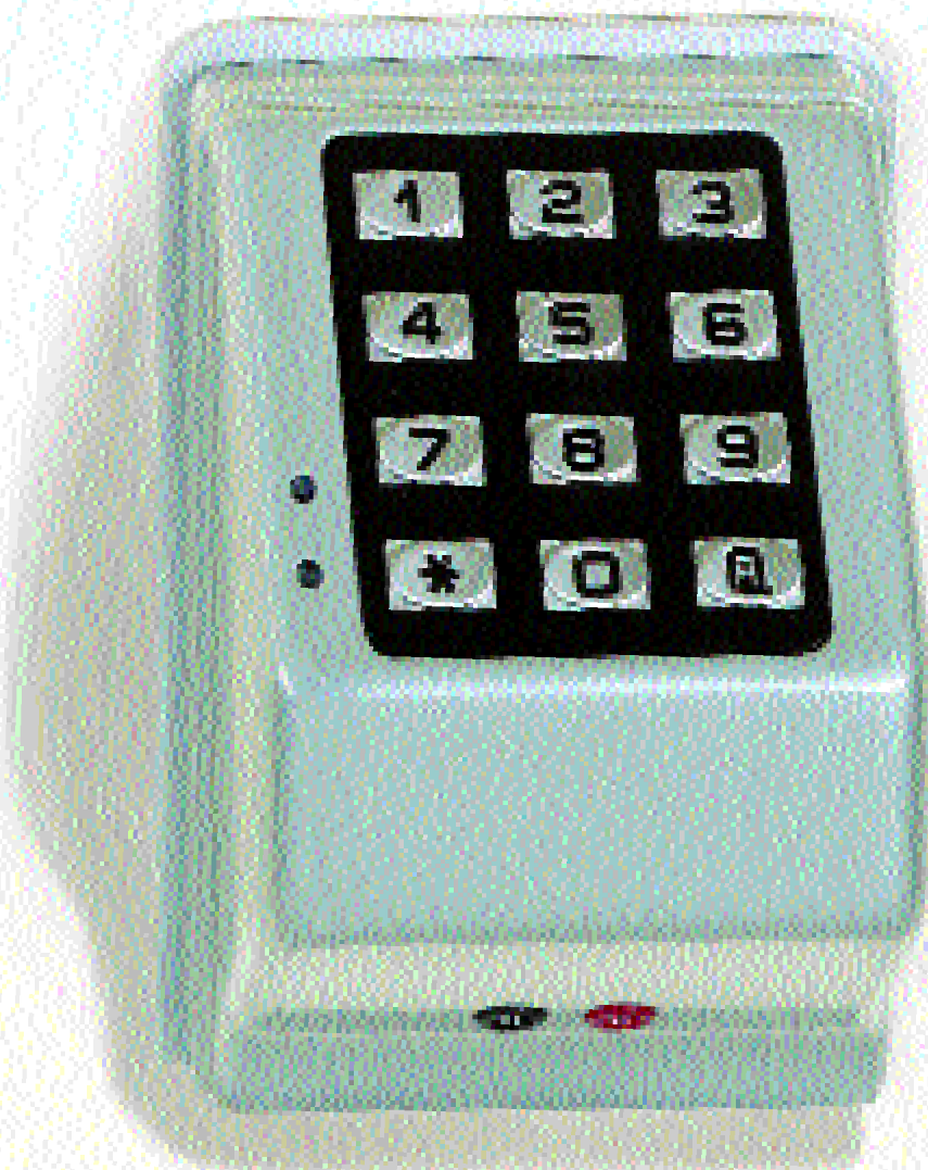
(Shown Actual Size)