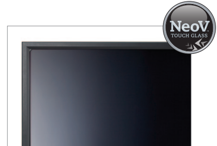
NeoV™ Touch Glass keeps the screen protected and looking new