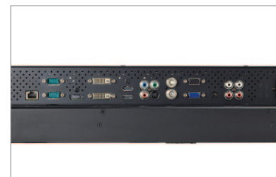
Multiple video inputs (VGA, DVI, HDMI, BNC, S-Video, DisplayPort and Component) allow for effortless system integration