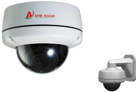
Part No. AFM. WB101

2 Megapixel IR Vandal proof Dome IP Camera Smart Focus Lens Inside X3.5 Zoom